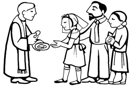
Receive the Body of Christ

All Saints' Mission Statement ~ To live out our Baptismal Covenant in Eucharistic worship, healthy community, and loving service.